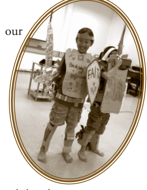
Citizens of the heavenly kingdom, put on the whole armour of God!