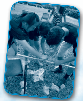
The shepherds enjoying team-building games

Praise the Lord for the two-day conference in which about 50 saints participated! The theme was “Serving the Lord and ministering to one another”. On the first day, we played immensely enjoyable team-building games at the meeting hall and the MacRitchie Reservoir, which strengthened the spirit of oneness among us.