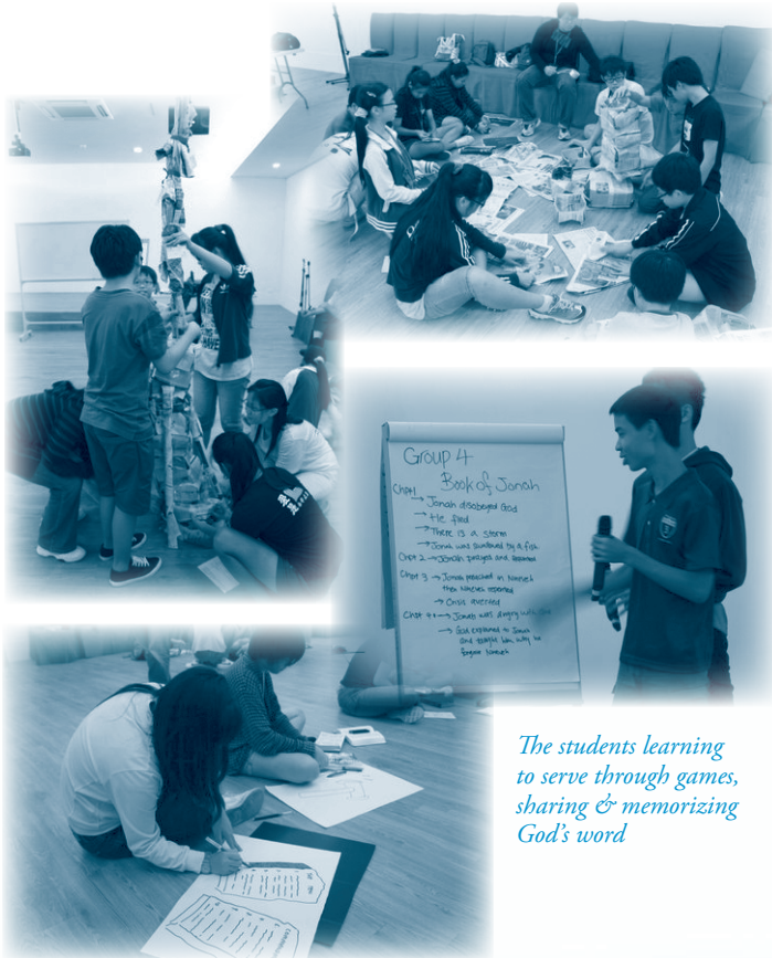
The students learning to serve through games, sharing & memorizing God's word

It was very inspiring and encouraging to learn about the authenticity of the Bible, and we appreciated the great love of God in preserving the continuity of His Word from the past generations to our present age.